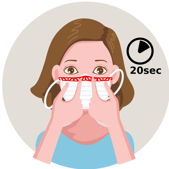
Press strip with mask against nose and cheek profile with four fingers, wait 20 seconds for strip to harden