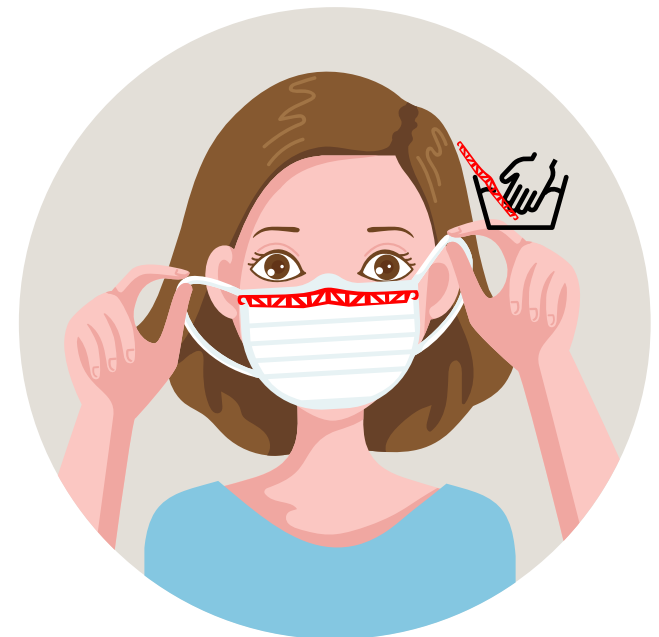
Keep the strip and hand wash after use, while discarding the masks