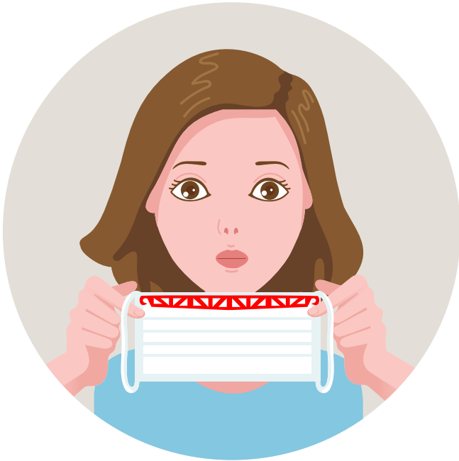
Attach strip to outside of mask